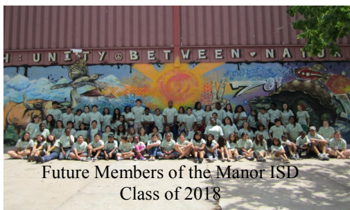
Future Members of the Manor ISD Class of 2018